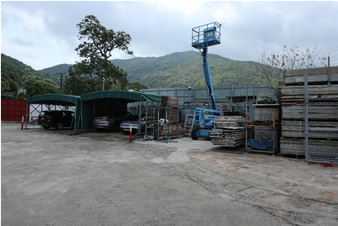
Photographs 19 & 20 – Containers & loading/unloading areas close to Godown No. D1 and parking areas near the second entrance/exit