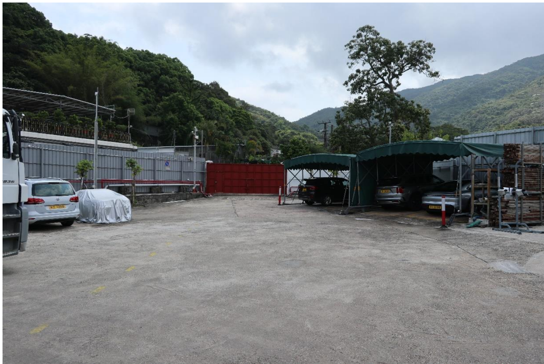
Photographs 17 & 18 – Entrance to Godown No. A3 and the loading/unloading /parking area