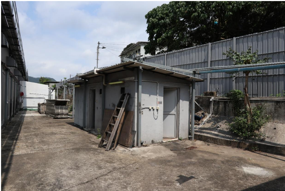
Photographs 15 & 16 – Lane between Godown No. A3, D and D1 and the toilet next to Godown No. A3