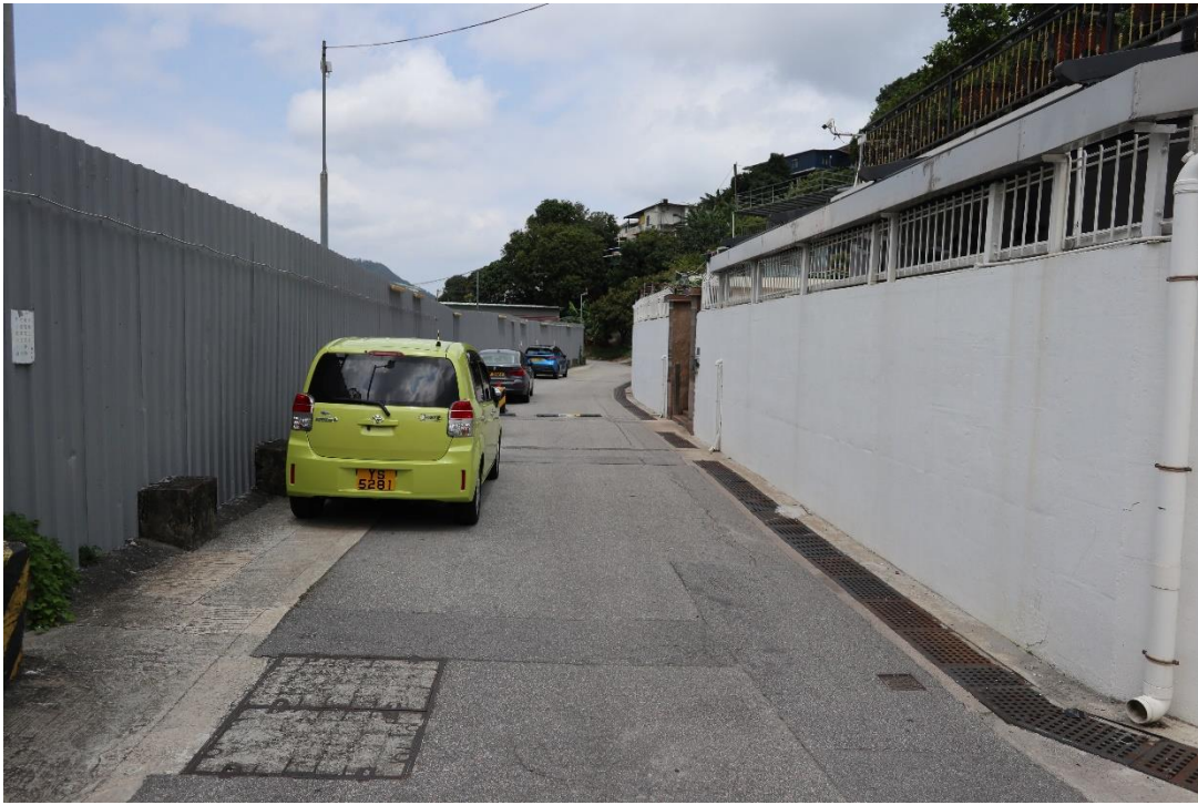
Photographs 21 – Access road between the temporary Godown and ancillary staff quarters