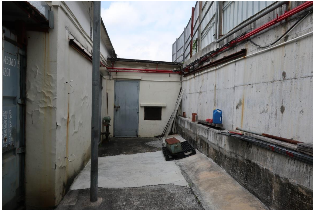
Photographs 11 & 12 – The lane leading to Godown No. F and entrance to Godown No. F