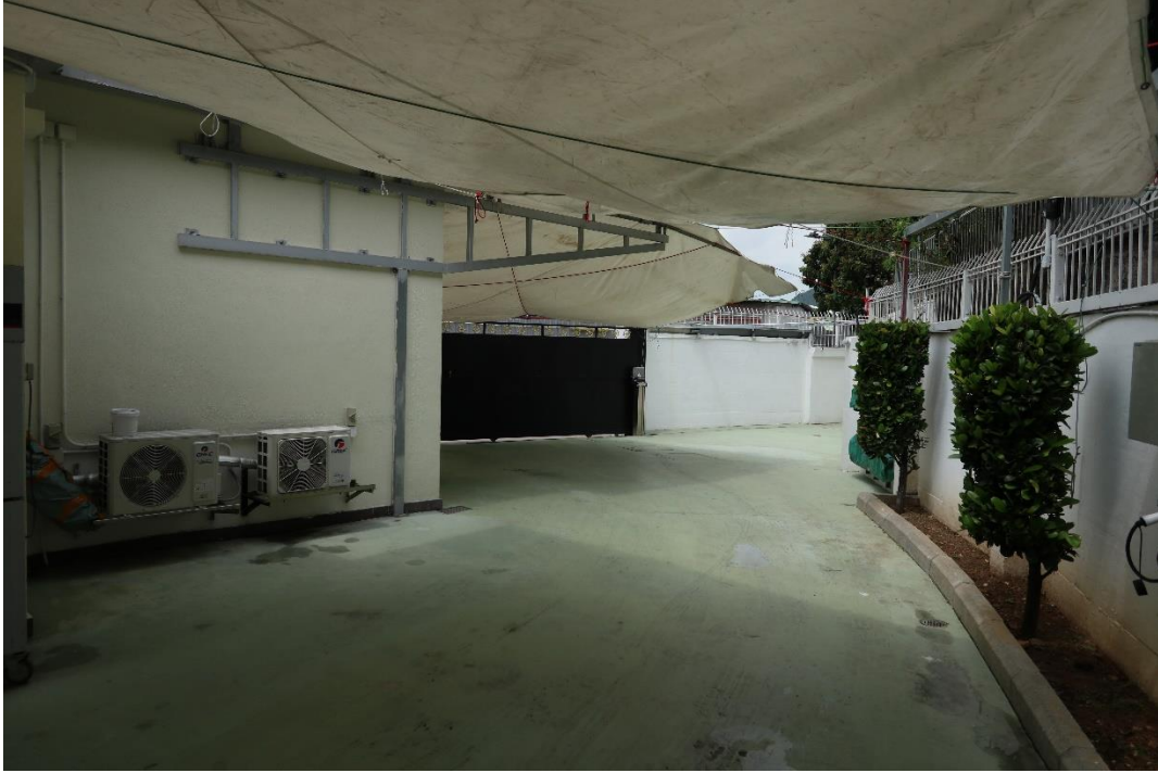
Photographs 23 – Ancillary staff quarters