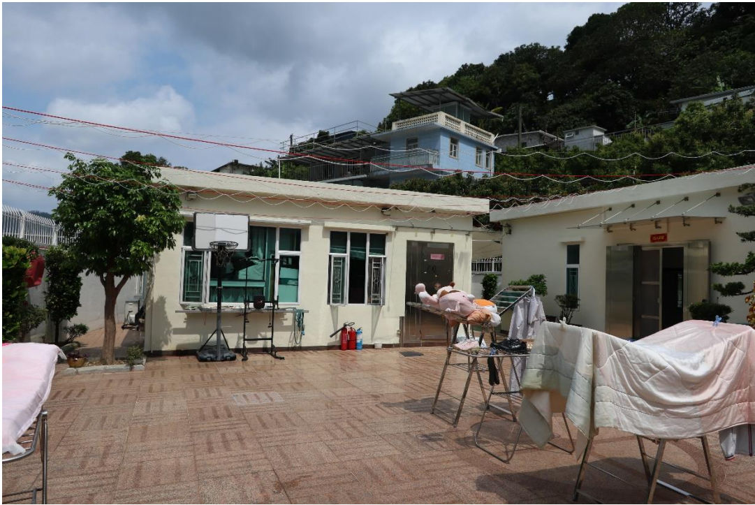
Photographs 22 – Ancillary staff quarters