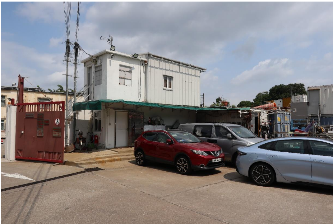
Photographs 5 & 6 – Temporary structures located near the entrance and the site office of the Godown