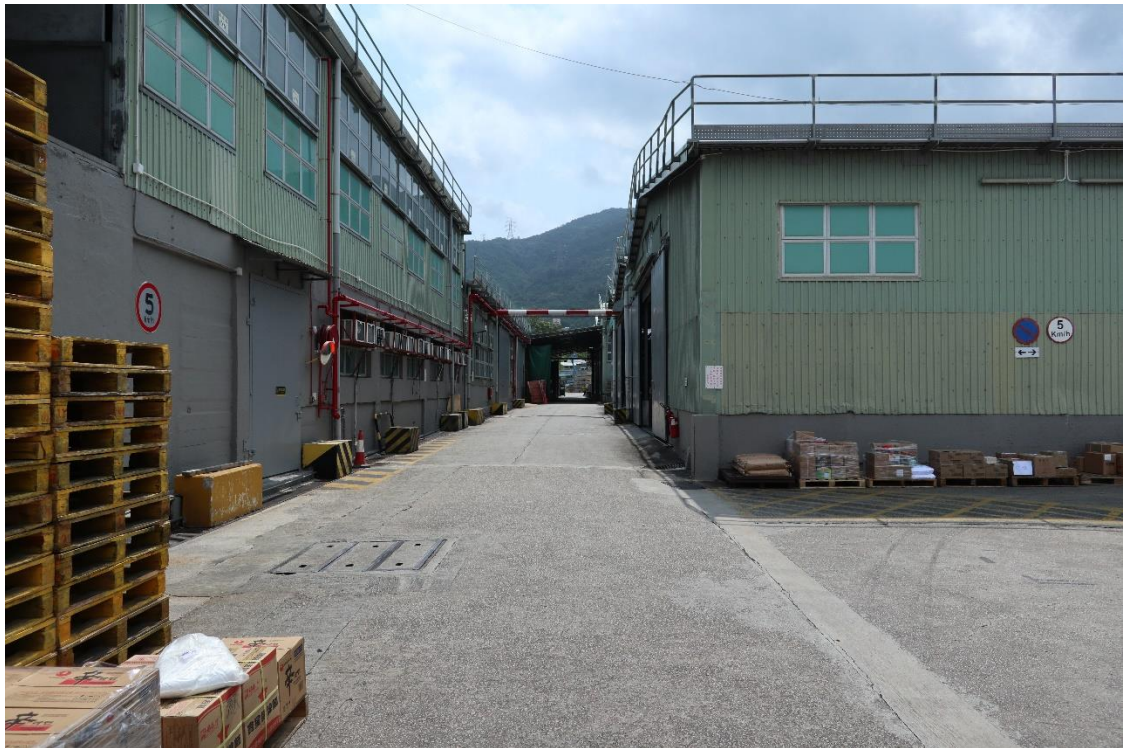
Photographs 7 & 8 – The fire facilities and a lane leading to Godown Nos. A1 & A2, A3 & B