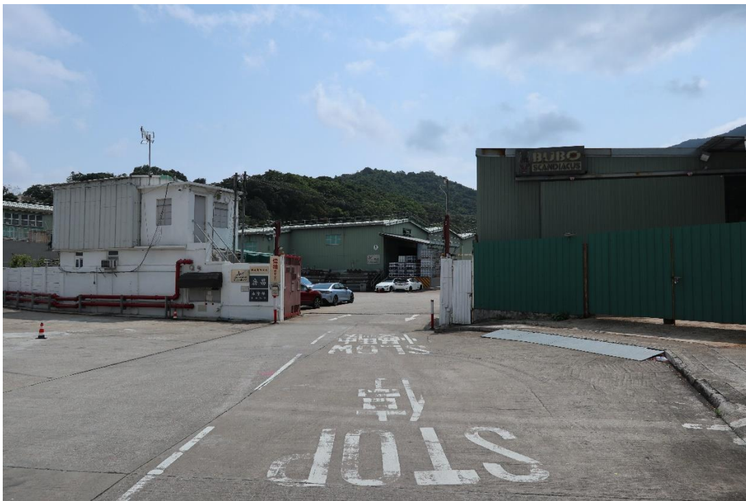
Photographs 3 & 4 – the kiosk and road markings for the approved traffic improvement scheme