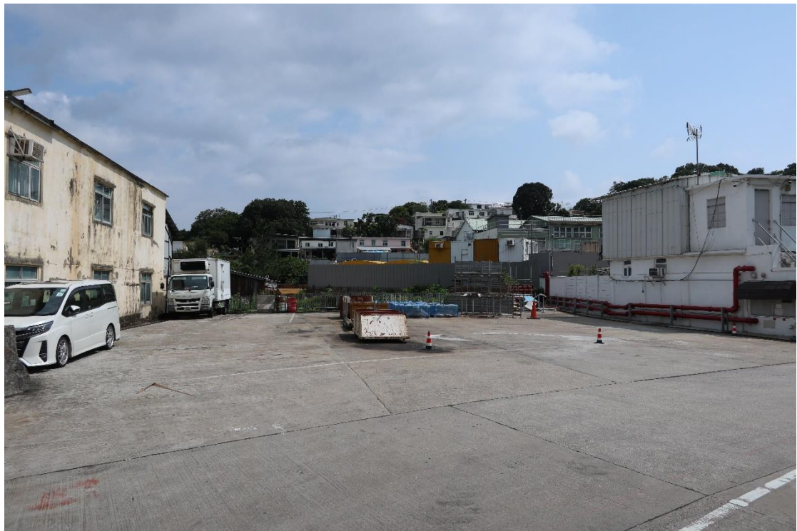
Photographs 1 & 2 – Main entrance/exit to the temporary Godown via Lot No. 1666SC RP