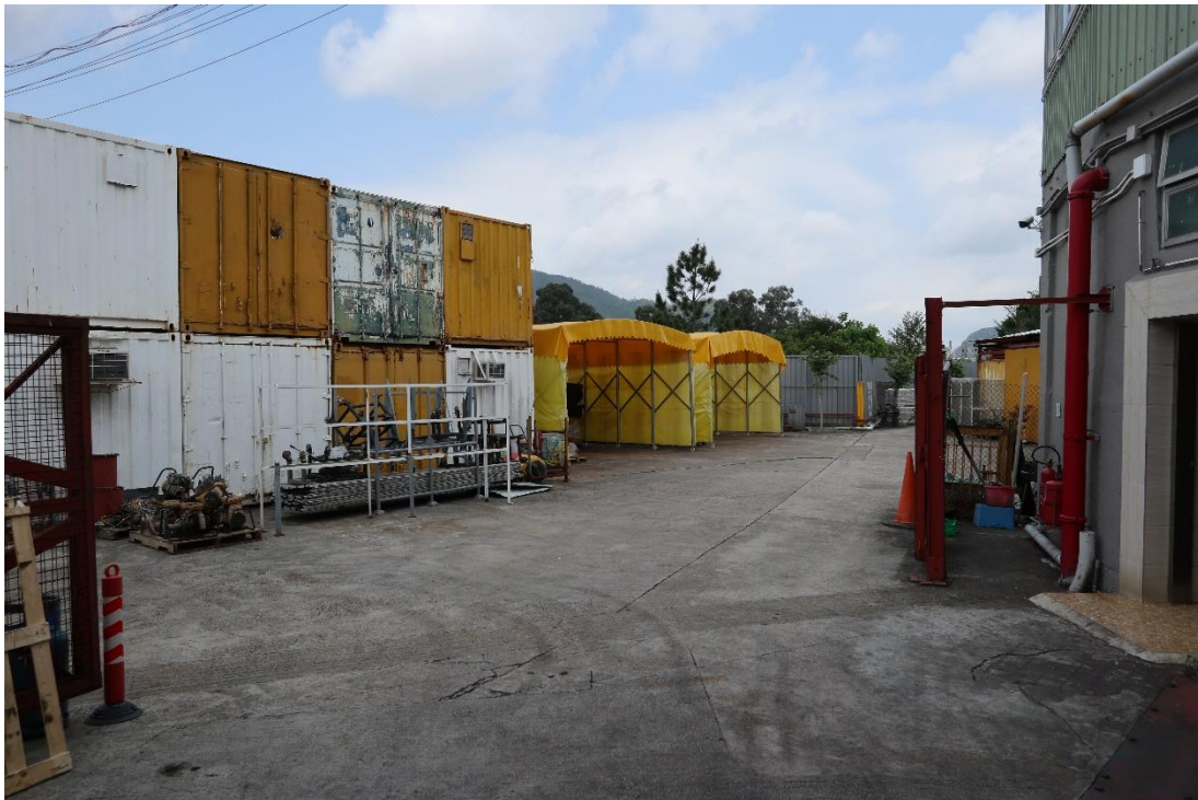
Photographs 9 & 10 – The containers located near the fire facilities and opposite Godown No. F