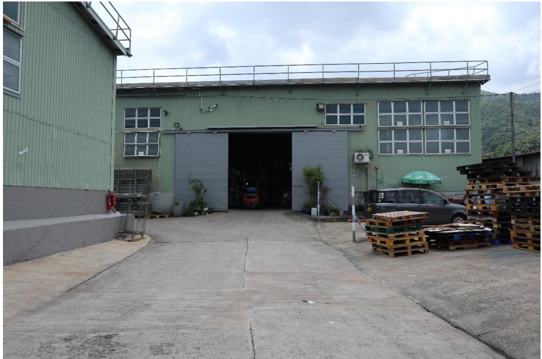
Photographs 13 & 14 – The back of Godown Nos. A1, A2 & A3 and Godown No.C